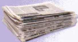
Newspapers & inserts