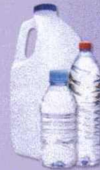
Rinsed plastic bottles & jugs