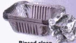
Rinsed clean, balled aluminum foil & pie pans