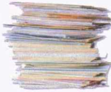
White & color office paper