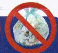
Food Waste & Trash

Unacceptable Aluminum – Soiled aluminum foil, soiled tin cans