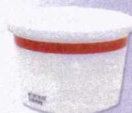
Rinsed #1-7 plastic tubs & screw-top jars