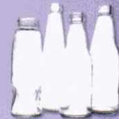
Rinsed glass bottles & jars