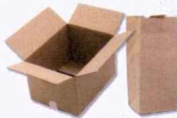
Corrugated cardboard & paper bags