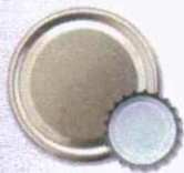
Loose metal jar lids & steel bottle caps