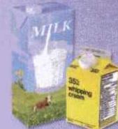
Rinsed paper milk/juice cartons