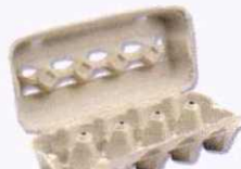
Paper egg cartons