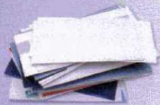
Opened mail & greeting cards