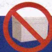
Styrofoam & Coolers